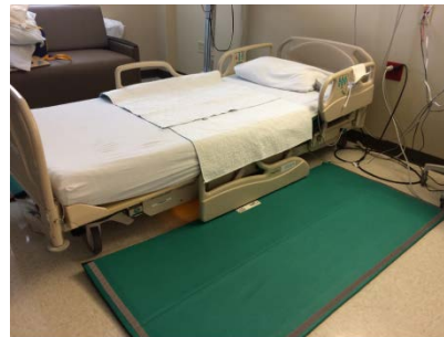
Low Bed with Mat **

5-Star Response When you call, we will let you know how quickly we can get to you.