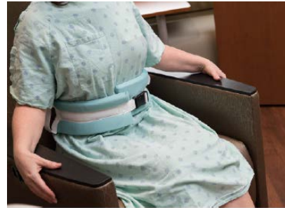
Self-Release Belt * (37361)