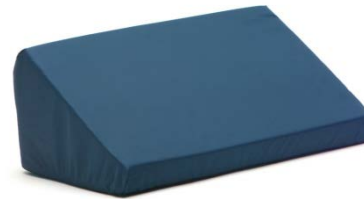
Chair wedge ●