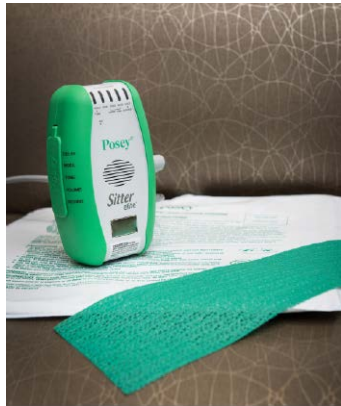
Chair Alarm Pads ●